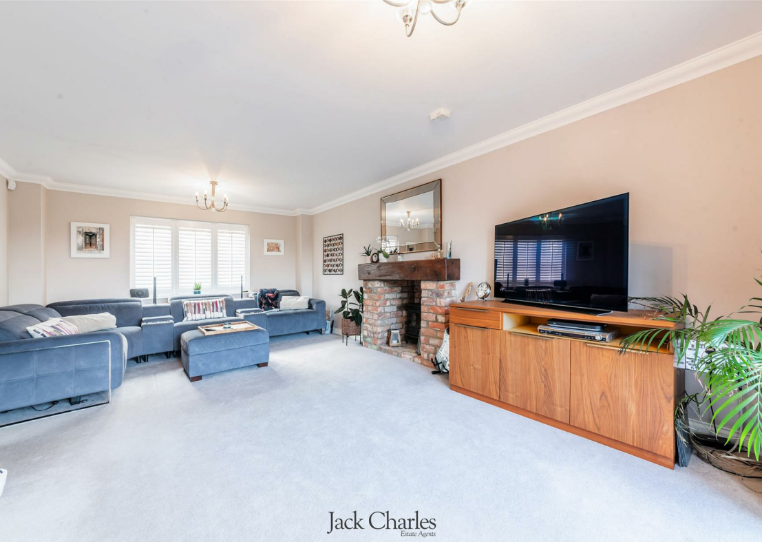
Jack Charles Estate Agents